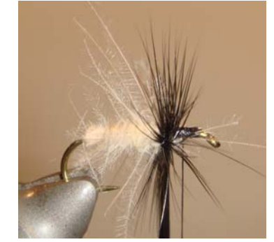
9. Wind a hackle of 2-3 turns