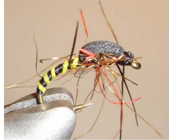
11. Cut off the excess of foam