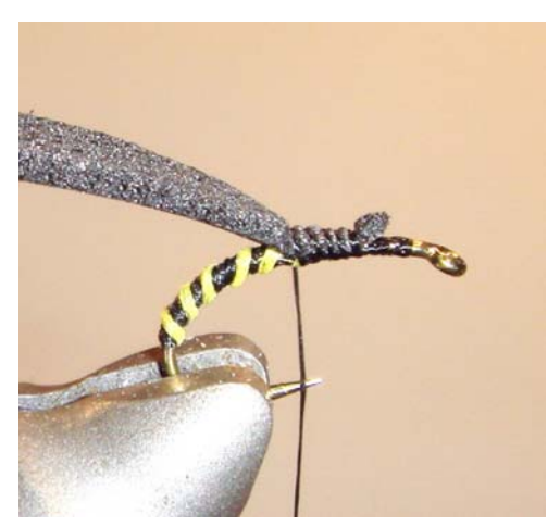
6. Tie in a strip of foam