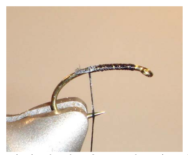
1. Tie in the thread up to the point of the hook