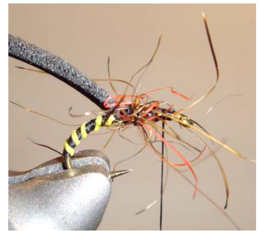
7. Insert a pinch of dubbing in a loop