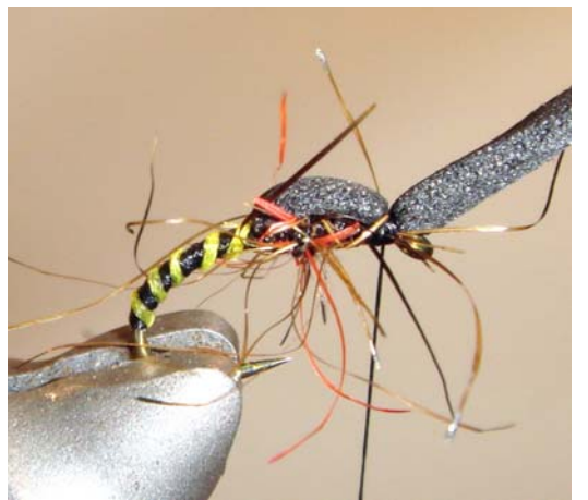
9. Flip the foam to the eye of the hook 10. Tie off