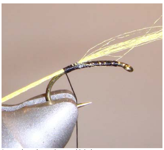
2. Tie in the ribbing