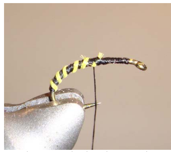
5. Wind the ribbingRippung winden