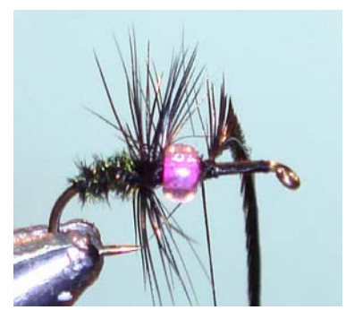
14. Tie in a cock feather