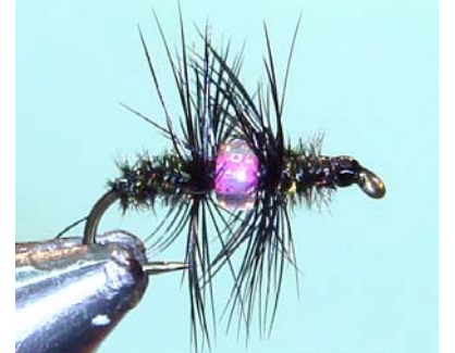
25. Varnish the head with black head cement