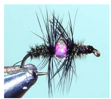
23. Wind a neat head24. Whipfinish