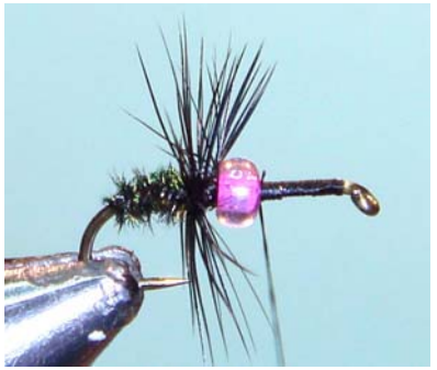
12. Tie in the thread at the eye of the hook 13. Wind the thread to the middle of the hook