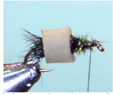
20. Wind the thread to the eye of the hook