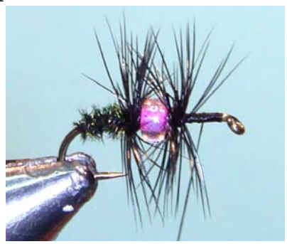
15. Wind a 2-3 turns hackle close to the pearl 18. Slide a silicon tube over the hackle