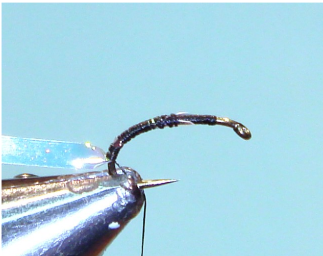
3. Wind the thread over the tinsel far down into the curvature of the hook