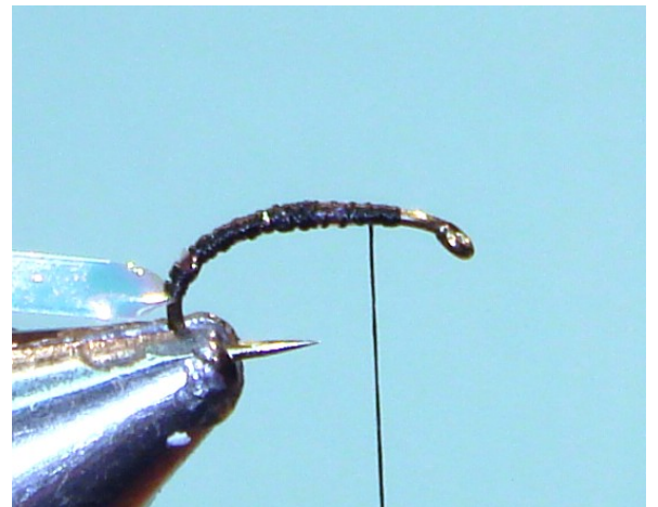
4. Wind back the thread to the eye of the hook