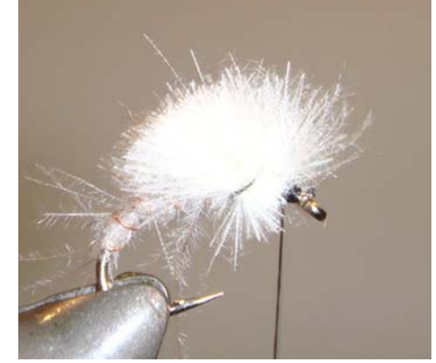
13. Cut the indicator into the correct shape

9. Get the fibers of a white CDC feather and insert them in a loop10. With your fingernail push the fibers against the hook shank11. Now start twisting the loop