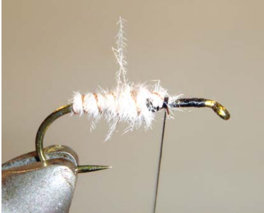
8. Rib the rear body with the copper wire