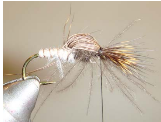
13. Flip the deer hair over the thorax and tie off at the eye of the hook