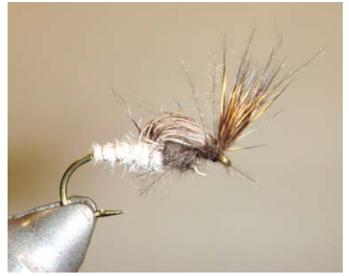
14. Wind the head of the fly in front of the deer hair to lift the tips of the hair