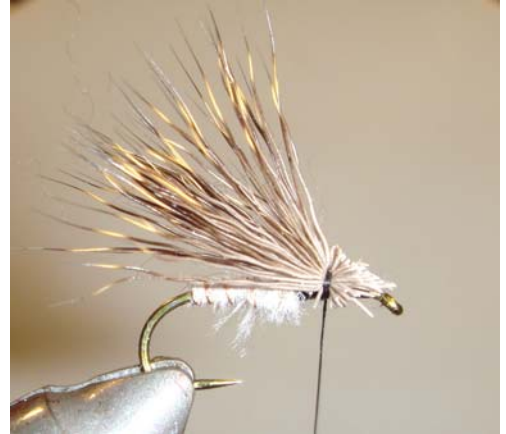
9. Tie in the deer hair