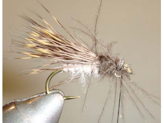
11. Wind the CDC Feather around the hook shank to form the thorax