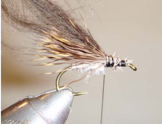
10. Tie in the dark CDC feather with the tip of the feather