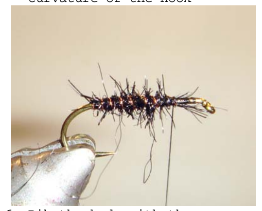
6. Rib the body with the copper wire