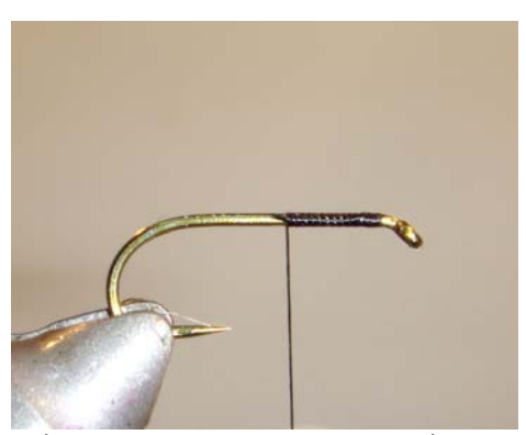
1. Tie in the thread to the middle of the hook shank