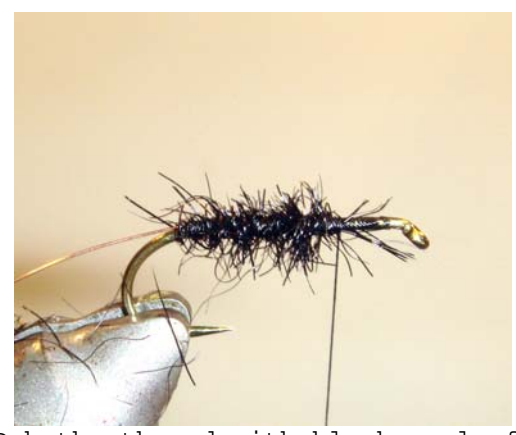
4. Dub the thread with black seals fur