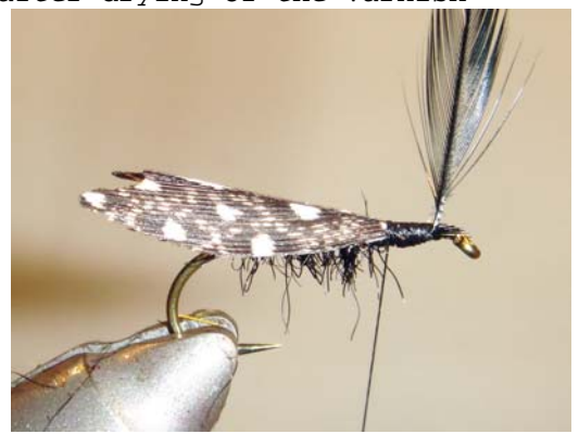
12. At the eye of the hook, tie in the cock feather

Varnish the feather with "nail repair" Alternative: If you do not possess wing burning irons, varnish the feather and cut in shape after drying of the varnish