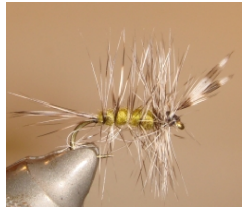
11. Wind head in front of the wings 12. whipfinnish 13. black or red head cement