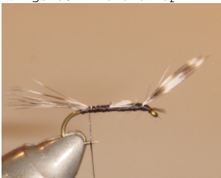
6. Tie in a few barbs of a grizzly feather as a tail