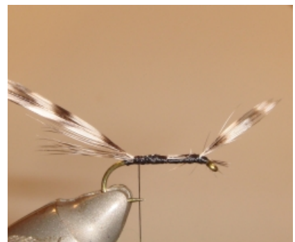
7. Tie in a grizzly cock feather