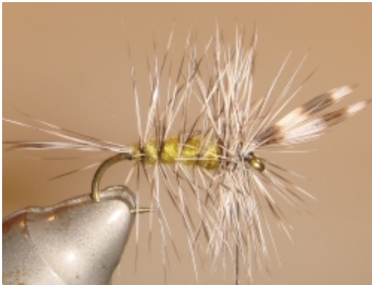
10. Wind a few compact turns at the beginning of the wings