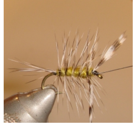
9. Wind the grizzly feather in wide turns in direction of the eye of the hook