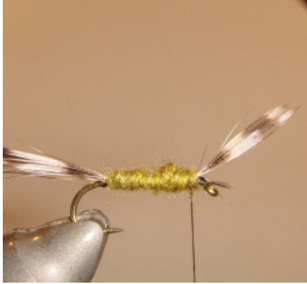
8. Dub the body