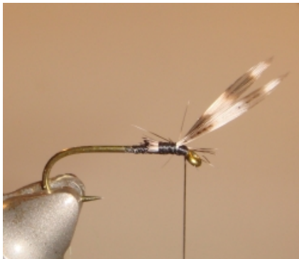
3. Cut off the excess of the feathers 4. Wind a few turns of thread in front of the wings to lift them up