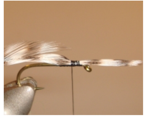
2. Tie in 2 grizzly cock feather tips as wings (length approx. hook shank)