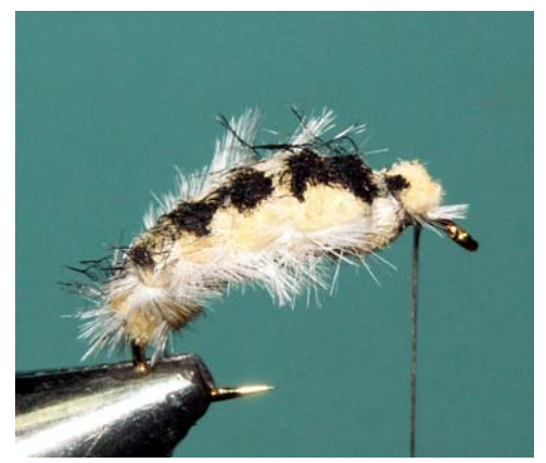
11. Use a black permanent marker to color the back of the nymph.