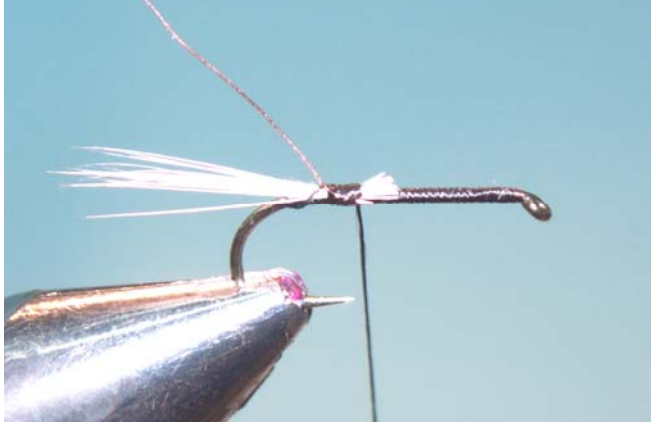
3. Tie in the ribbing wire