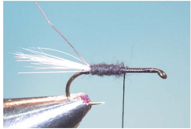
Dub the thread and wind the body of the fly