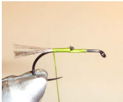
3. Cut the tail to half shank length