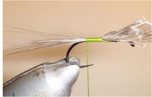
2. Tie-in some cock feather tips as a tail