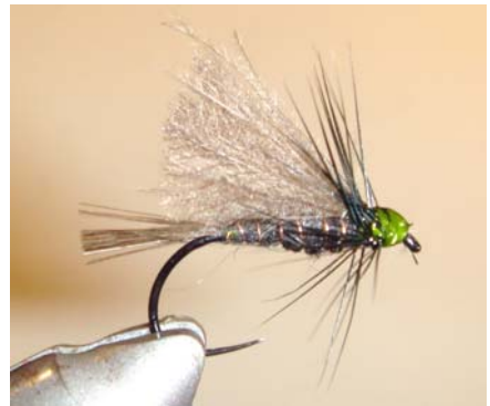
13. Wind a neat head 14. Whipfinnish 15. Use transparent head cement to varnish the head