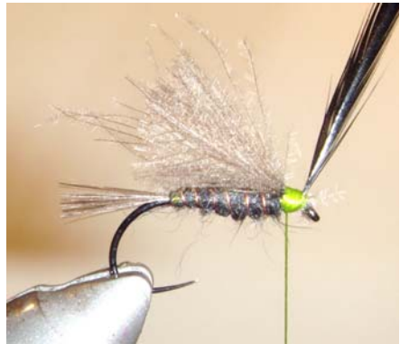
11. Tie in the hackle