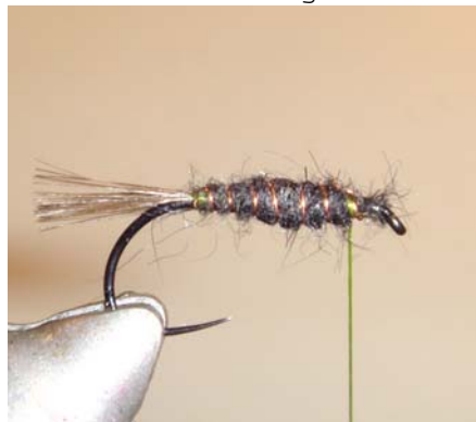
7. Rib the body