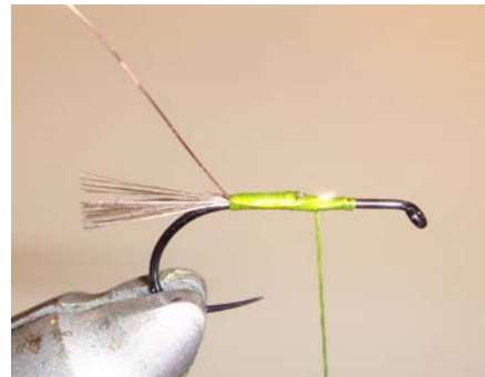
4. Tie-in the Ribbing wire