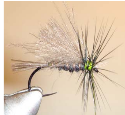
12. Wind hackle