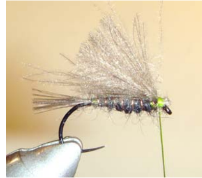
9. Trim the wing 10. Cut off excess