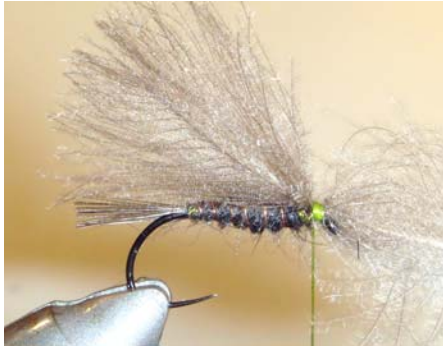
8. Tie-in a CDC Feather as wing