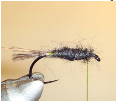
5. Twist the dubbing on the tying thread