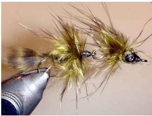
19. Attach clip to the hook