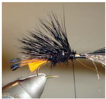
16. Wind the ribbing wire through the wings to the tie-in point of the front wing