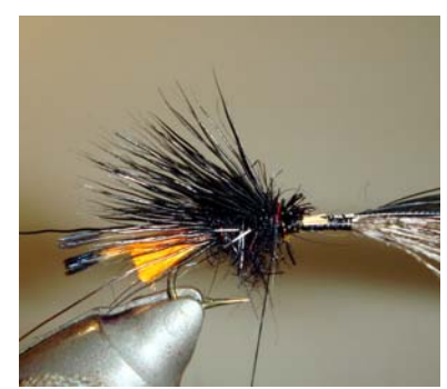
14. Wind 2 turns with the dubbed thread