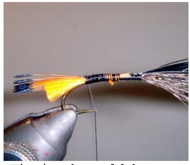
8. Tie-in the goldpheasant feather tips on top of the floss tail