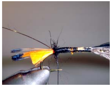
10. Twist a small quantity of dubbing on the thread and wind one turn at the beginning of the tail