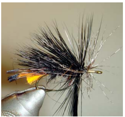
19. Wind 2 turns with the cock hackle feather