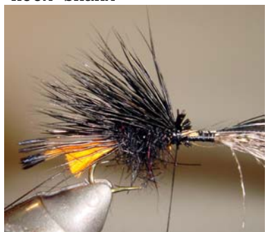
15. Tie-in again a small amount of deerhair on top of the hook shank