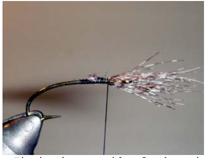
Tie-in the partridge feather tips wind the thread in direction of the eye. The feather tips should be spreading around the hook shank