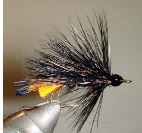
23. Wind the head