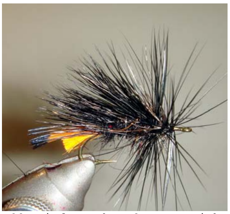
22. Wind another 2 turns with the cock hackle in front of the partridge feather tips