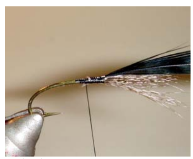
4. Tie-in the cock hackle feather