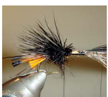
13. Tie-in again a small amount of deerhair on top of the hook shank