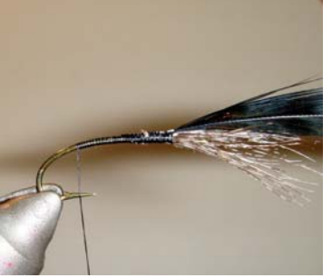
5. Finish winding the thread into the curvature of the hook