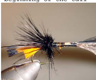
12. Wind 2 turns with the dubbed thread