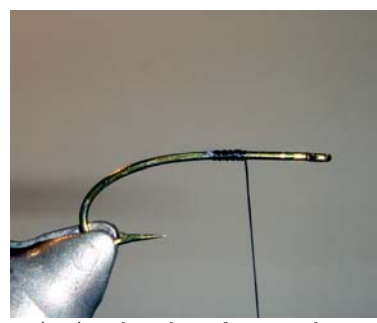
Tie-in the thread at a short distance from the eye of the hook