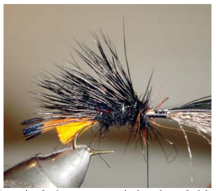
17. Wind 2 turns with the dubbed thread