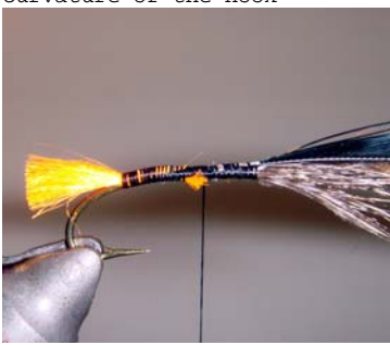
7. Cut the tail such that it just extends over the hook