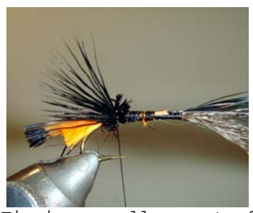
11. Tie-in a small amount of deerhair on top of the hook