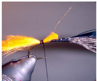
6. Tie-in the yellow floss as a tail