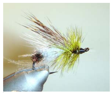
18 Wind the head