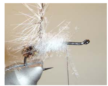
9 Wind the body of the Fly