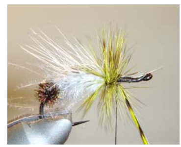
12 Tie in the hackle feather