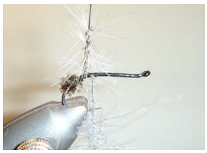
Twist a bunch of CDC feathertips in the split thread