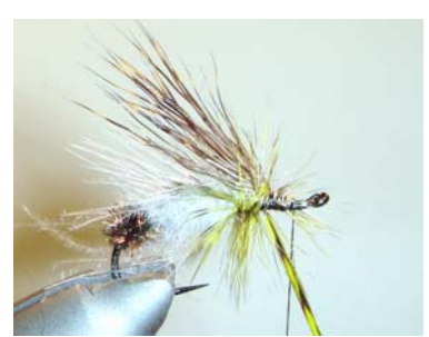
16 Tie in a bunch of deerhair as a wing