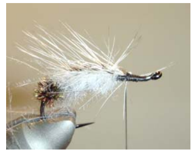
10 Flip the loop to the front of the hookshank