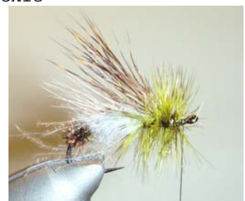
17 Wind the hackle over the tiein point of the wing (2-4)turns)