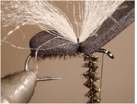
11 Twist 2 peacock herls with a loop of tying thread