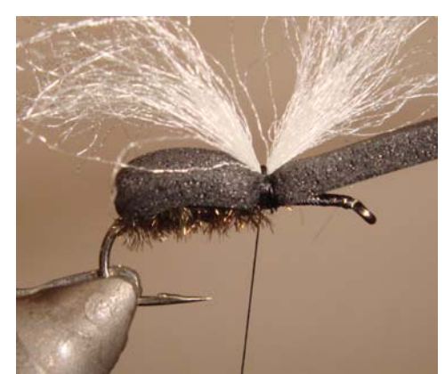
10 Tie in a strand of glow yarn