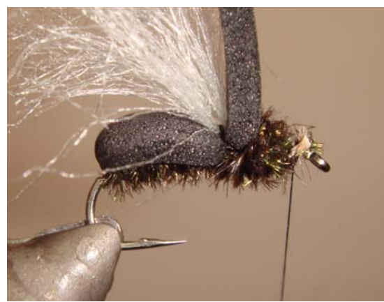
12 Wind the thorax