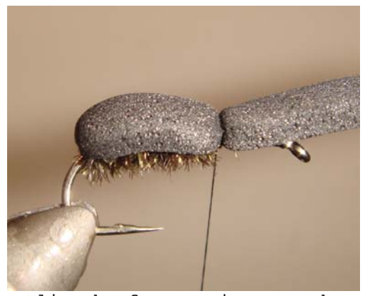
Flip the foam strip over the rear part of the body Secure the foam strip