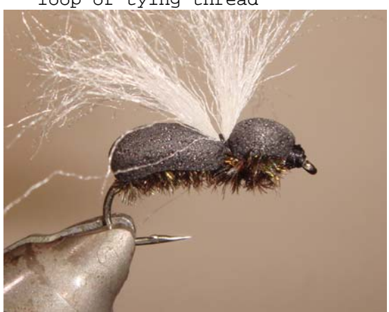
13 Flip the foam strip to the eye 16 Trim the wing of the hook