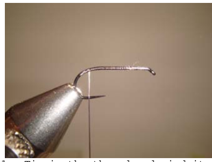
Tie-in the thread and wind it in close turns to the beginning of the curvature of the hook