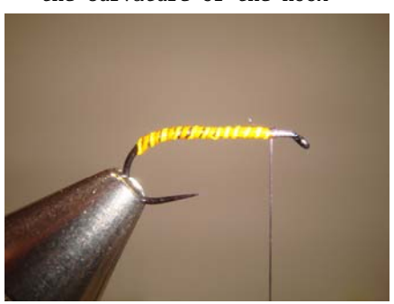
4. Wind the body of the fly with the Moose hair