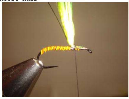
6. Tie-in the glowbrite and fix it with 2 7. Tie-in the cock feather turns around the horse hair