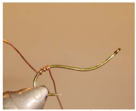
1 Tie in the copperwire in the curvature of the hook