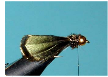
13 Twist the peacock hers together with the thread 14 Wind thorax

10 Wind the ribbing to the front 11 Tie in an Amherst neck feather on both sides of the body