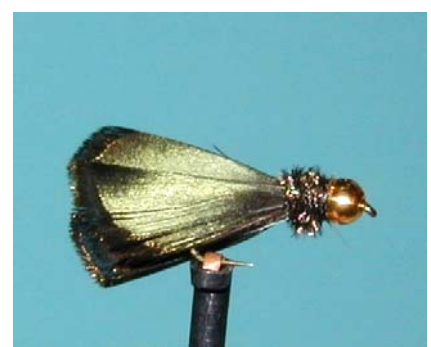
15 Whipfinish 16 Cut off the thread

10 Wind the ribbing to the front 11 Tie in an Amherst neck feather on both sides of the body