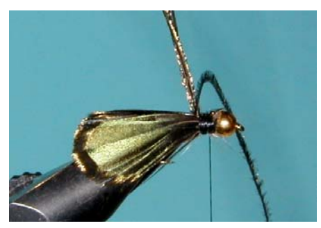
12 Tie-in 2 peacock herls