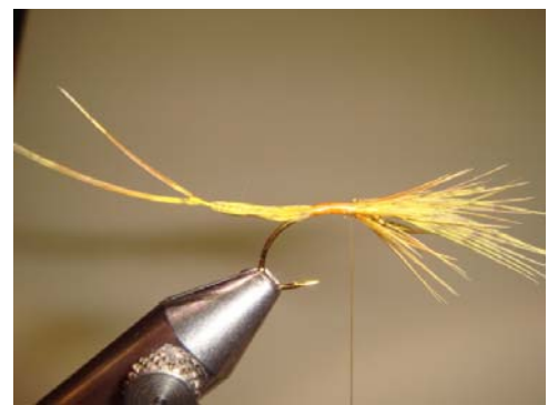
3 Cut out the quill of the partridge feather