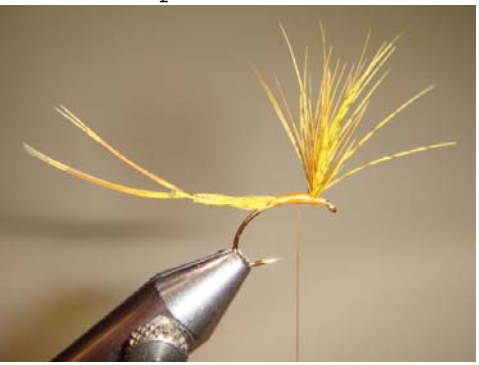
9 Lift the partridge feather tips an wind a few turns in front of this wing

10 Wind the thread backwards 1-2 mm behind the wing