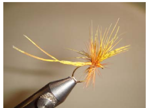
14 Wind the head15 Whipfinish16 Cut off thread