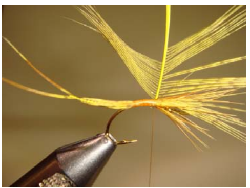
7 Lift the stem of the partridge feather upwards