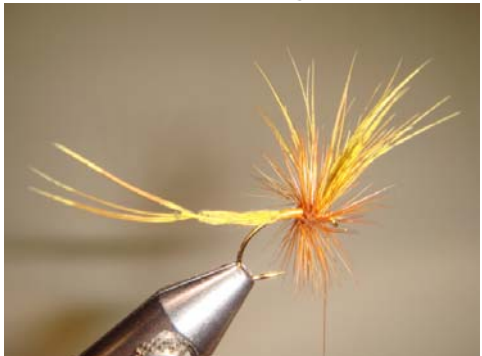
13 Wind the hackle in direction of the eye. (3-4 turns behind the wing and 2-3 turns in front of the wing)

10 Wind the thread backwards 1-2 mm behind the wing