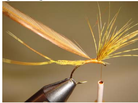
11 Tie in the cock feather 12 Wind the thread forwards to the eye of the hook