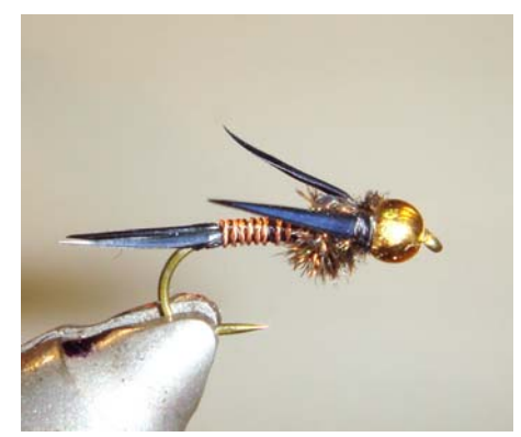
16. Let the glue dry