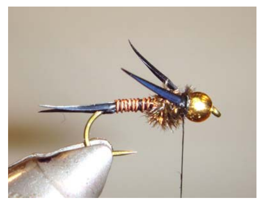
13. Tie in a goose biot on each side of the hook shank