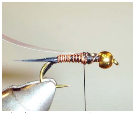
9. Tie in the pearl tinsel