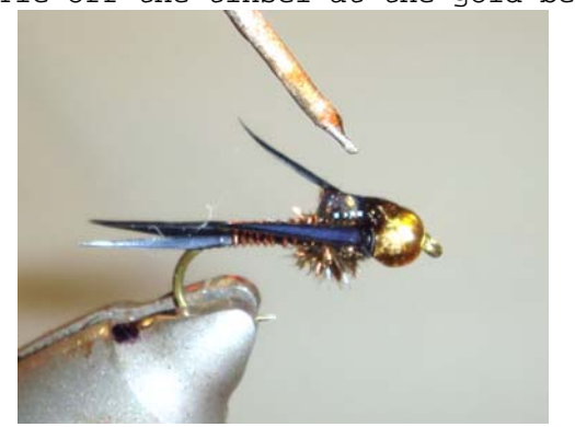
15. Apply a drop of 5 minute epoxy glue on the tinsel