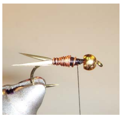
8. Wind the rear part of the body with the copper wire