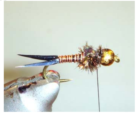
10. Tie-in the peacock herls and wind the thorax