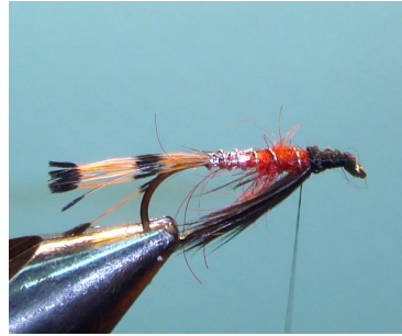
13. Bring the feather tips beneath the hook shank and fix them as an underwing