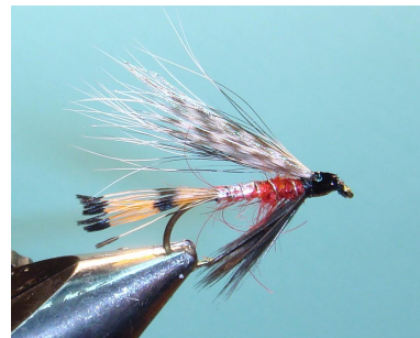
17. Wind head 18. Whipfinish