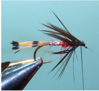
12. Wind 3 turns of hackle with the hen feather