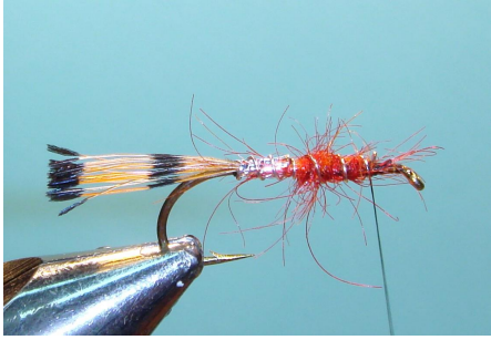
10. Wind the ribbing wire to the eye of the hook