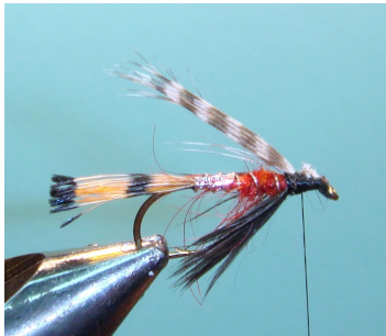
14. Tie in the first wing (Teal)