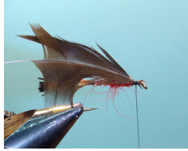
11. Tie in the tip of the hen feather