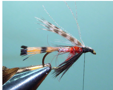
15. Tie in 4 strands of Chrystal flash