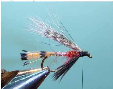
16. Tie in a bunch of squirrel tail hair