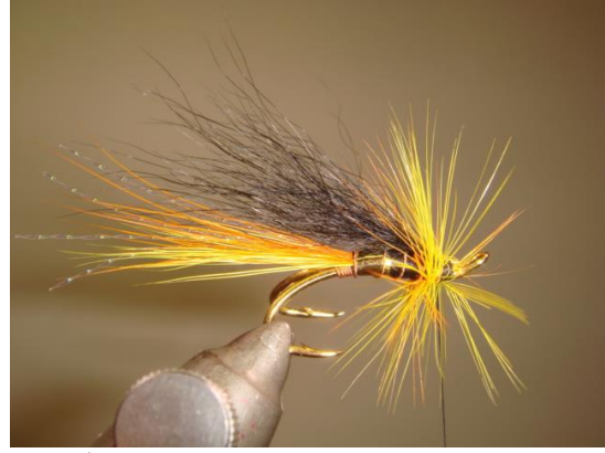
23 Wind a 2-3 turns hackle