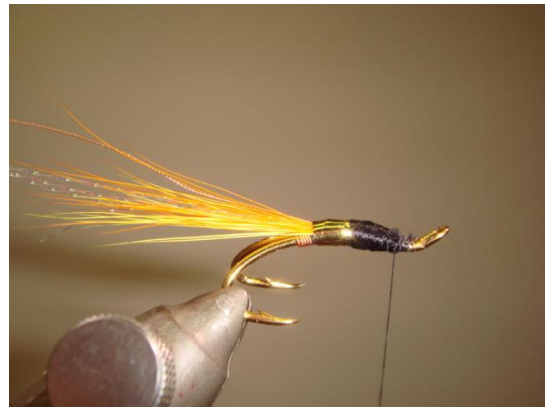
13 Wind the silk to the middle of the hook shank and back to the eye of the hook 14 Tie it off