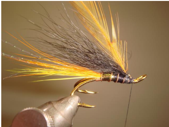
20 Tie in the orange cock feather