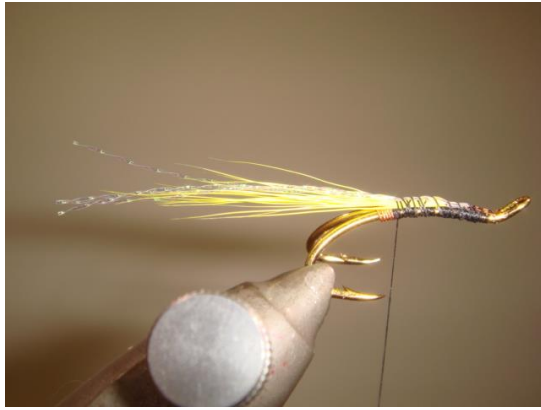
6 Tie in 4 strands of Chrystalflash