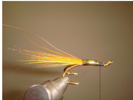
9 Tie in the golden Tinsel in the middle of the hook shank 10 Wind it backwards to the tag and again forward in direction of the eye 11 Tie it off