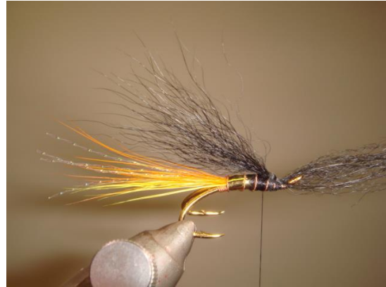
19 Tie in a second bunch of Fox hair slightly longer than the first wing