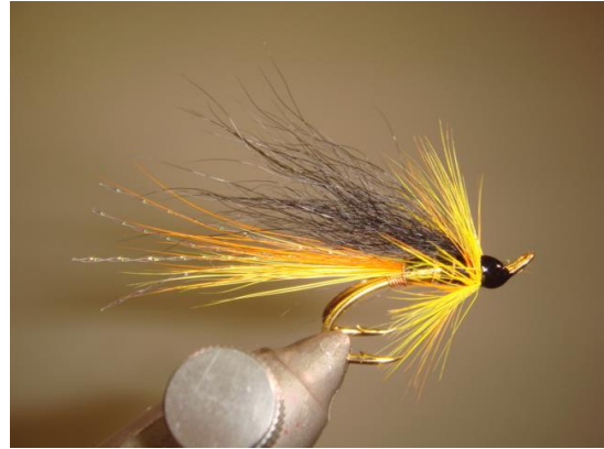
26 Apply a drop of black head cement to secure the windings