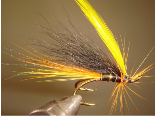
22 Tie in the yellow cock feather