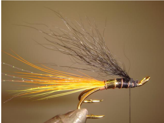
18 Flip the fox hair backwards and secure them