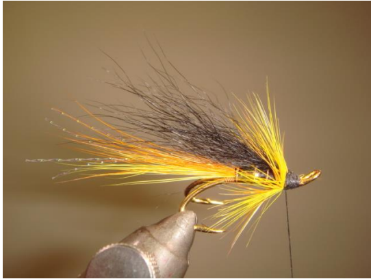
24 Wind the head of the fly 25 Whipfinish