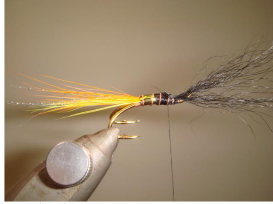
17 Tie in a small bunch of fox hair extending over the eye of the hook