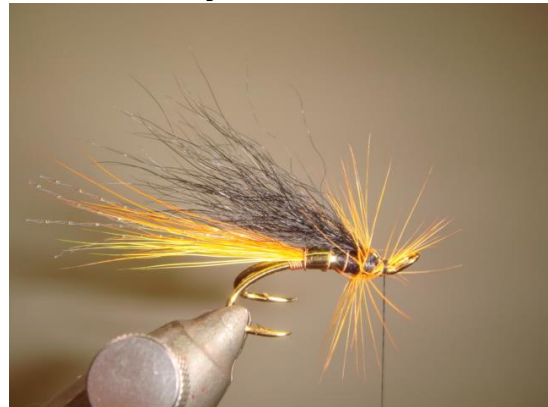
21 Wind a 2-3 turns hackle