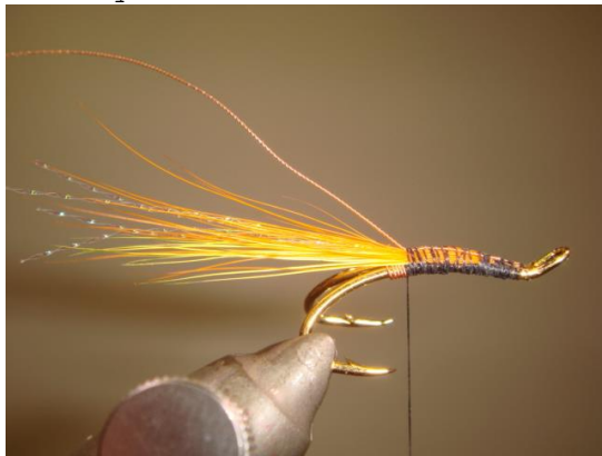
8 Tie in the twisted copper ribbing wire