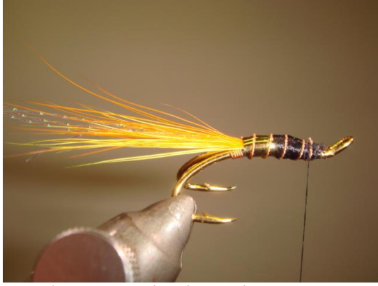
15 Wind the ribbing wire to the eye of the hook