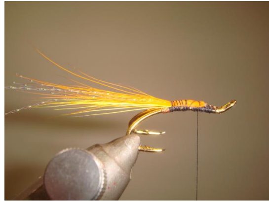
7 Tie in a few strands of orange bucktail