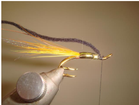
12 Tie in the the black silk or unistretch at the eye of the hook