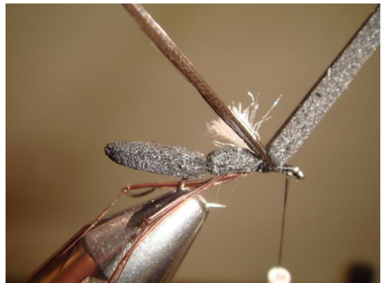
10 Tie in the black cock feather