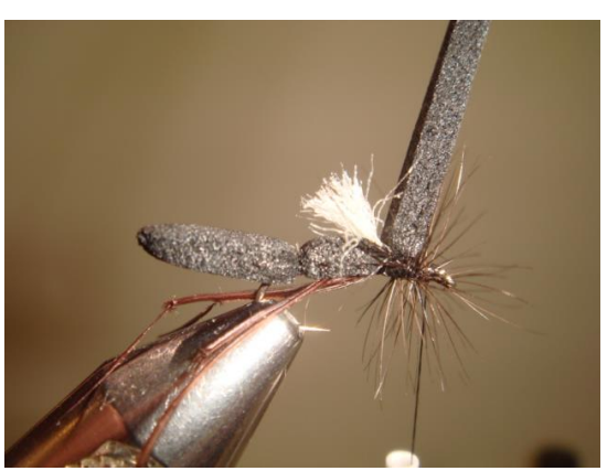
11 Wind the cock feather to the eye of the hook 12 Tie it off