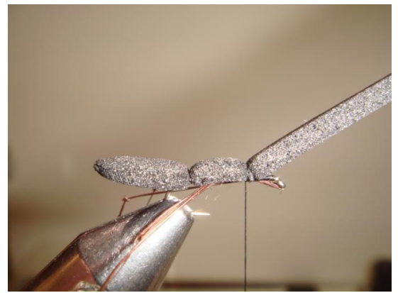
Flip the foam strip to the tie 9 Tie in a strand of glow yarn in point of the legs

8 Secure the foam strip with several turns of thread