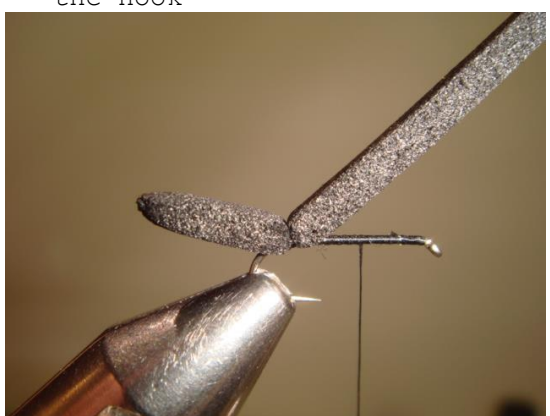
Wind the thread to the middle of the hook shank