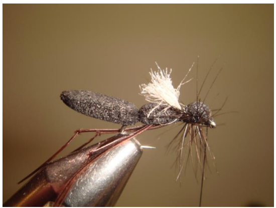
of the hook 14 Tie off the foam strip

13 Flip the foam strip to the eye 15 Whipfinish