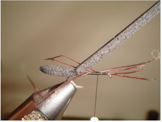
6 Tie in the knotted pheasant tail fibers as legs (2 on each side of the hook shank