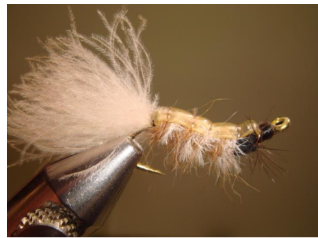
15. Wind head16. Whipfinish