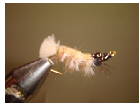
18. With the black permanent pen colour the latex above the head 19. Secure the windings with black head cement