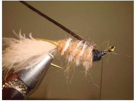
11. Tie in the black cock feather