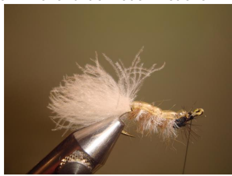
13. Flip the Latex strip to the eye of the hook