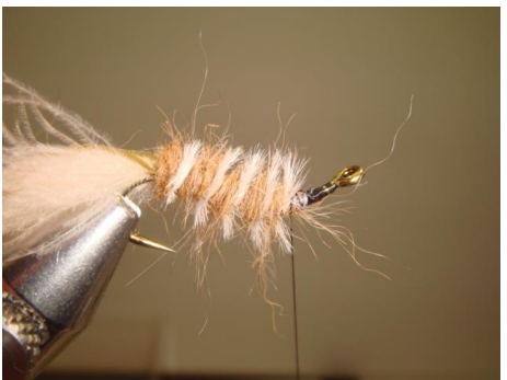
9. Rib the rear part of the body with the ostrich herl