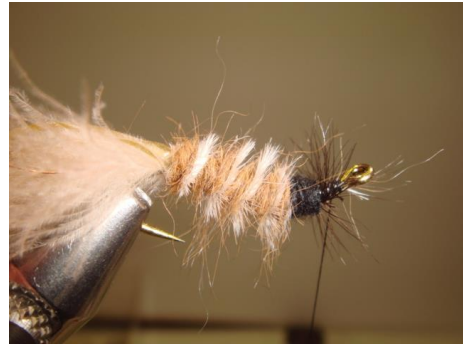
12. Wind 2-4 turns with the feather