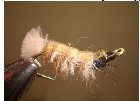
17. Cut the CDC puff to form a short tail