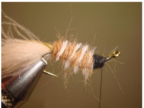
10. Twist some fine black dubbing to the thread and wind the head