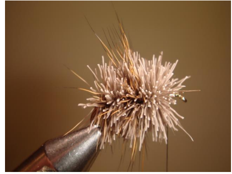
Insert Deerhair bunches into the loop