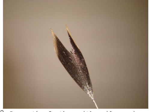
12 Cover the feather with nail repair varnish