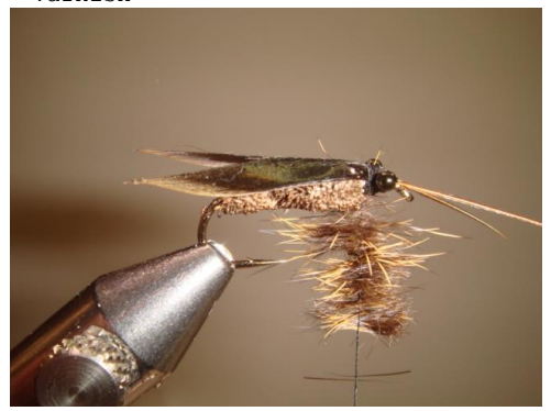
14 Insert Hare mask hair ito the split thread