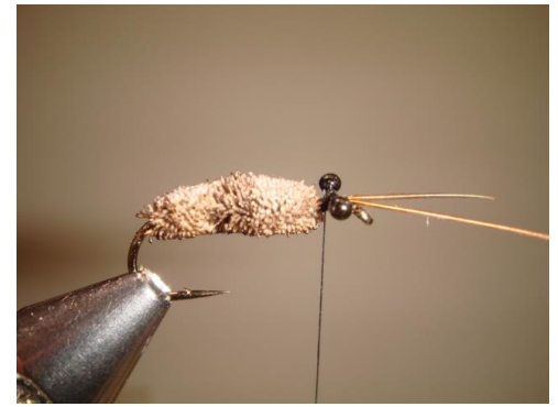
10 Tie in the eyes with figure 8 windings