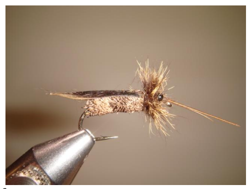
16 Wind head hackle between the wing and the eyes