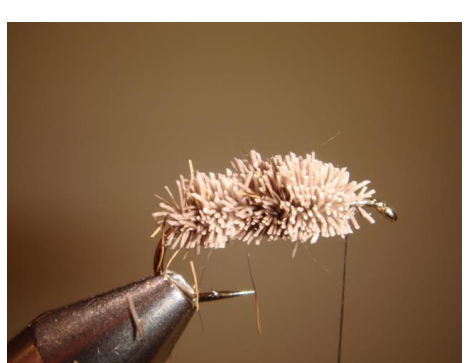
6 Trim the body with your scisors