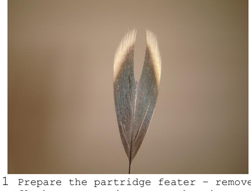
11 Prepare the partridge feater - remove flushy parts and cut out the tip