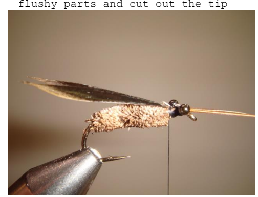
13 Tie in the partridge feather as a wing