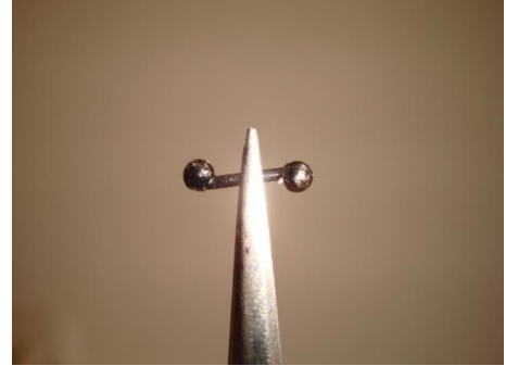
9 Prepare the eyes - melt the tips of the leader nylon with a lighter