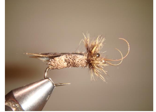
18 Using your scisors shape the antennas