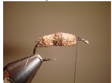
Using a lighter finish trimming of the body