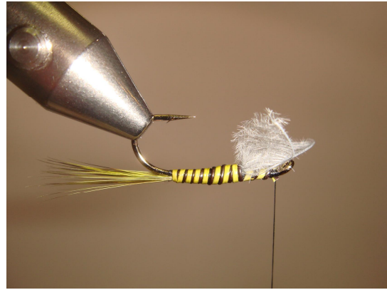
10 Wind the 2 Moose hair together to the tie in point of the wings.