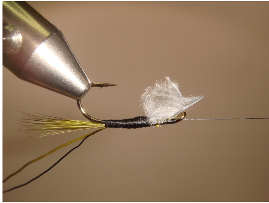
9 Wind a tapered body with your tying thread