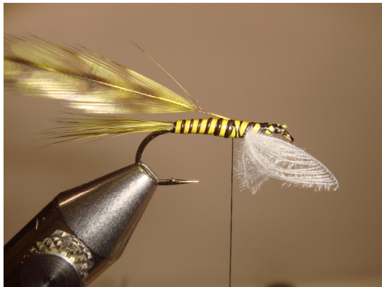
11 Rotate the vise back into its original position 12 Tie in the olive grizzly cock feather