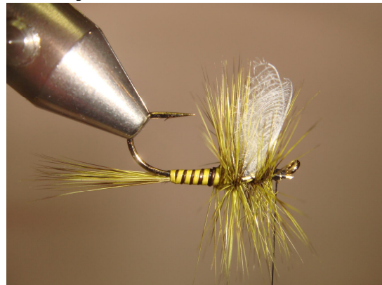
13 Wind the hackle (3-4 turns behind the wing and 3-4 turns in front of the wing)