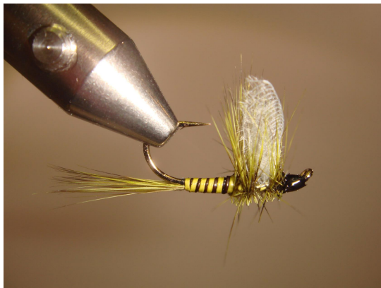
14 Wind the head of the fly 15 Whipfinish 16 Cut off the cock feather tips on the upper side of the hook shank 17 Secure the head with a drop of black head cement