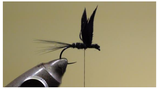
11 Wind the tinsel forward 12 Tie it off