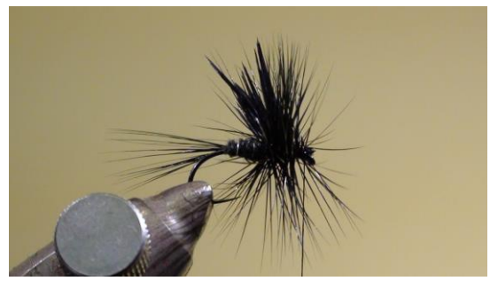
15 Wind the hackle (a couple of turns behind the wings and a couple of turns in front of the wings