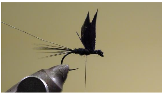
9 Twist some dubbing onto your thread