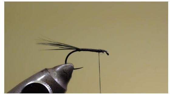
3 Tie in a bunch of black cock feather tips as a tail