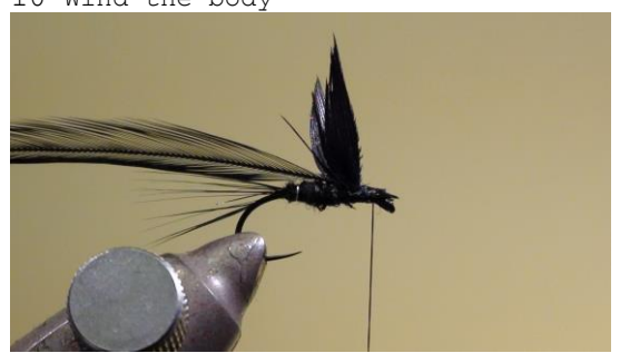
13 Tie in the cock feather behind the wings

14 Wind the thread to the eye of the hook.