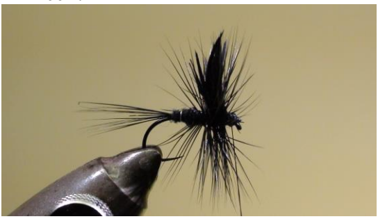
17 Wind the head

14 Wind the thread to the eye of the hook.