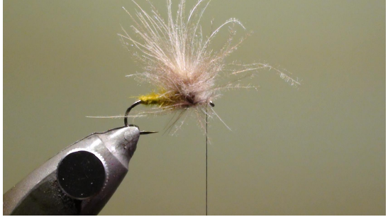
15 Wind the post of the fly pulling the white feather tips upwards after each

14 Twist your bobbin to secure the feather tips in the thread