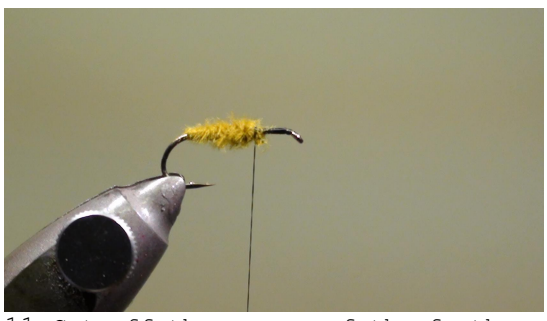
11 Cut off the excess of the feather 12 Trim off all free fiber tips