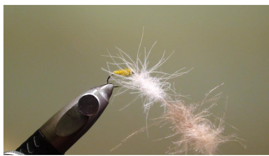
13 Split the thread and insert a bunch of white CDC feather tips and a bunch of dark grey CDC feather tips in the split thread

14 Twist your bobbin to secure the feather tips in the thread