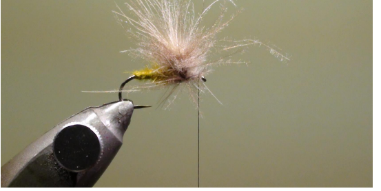
\overline{17} Wind the head of the fly

16 Wind the parachute with dark grey feather tips by winding them around the post above the hook shank. Each successive turn has to be made below the previous one