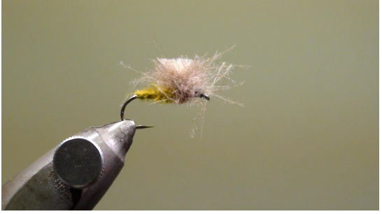
19 Trim parachute post and parachute feather tips to the correct length