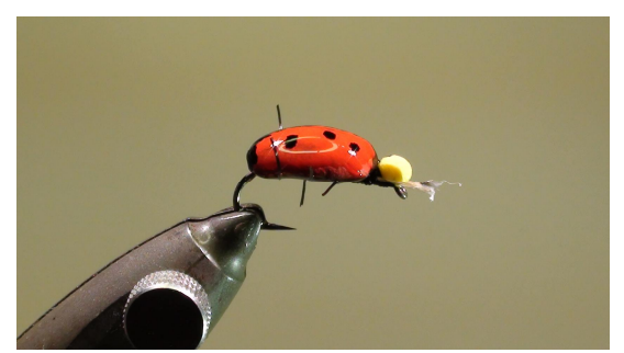
19 Trim the legs to the desired length