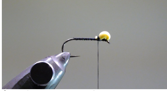
4 Flip the foam strip backwards 5 Tie it off