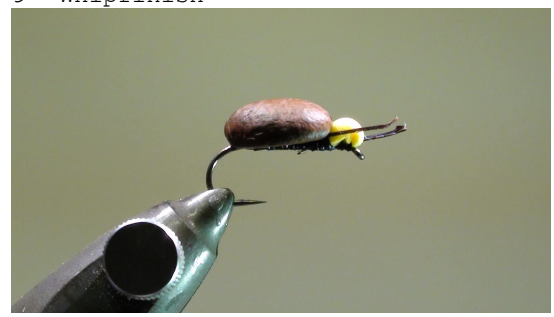
11 Fix the coffee bean on the hook shank using a few drops of instant glue

8 Wind the thread in close turns to the curvature of the hook and back9 Whipfinish