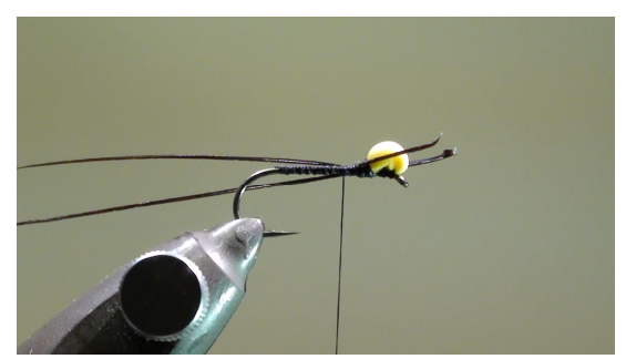
7 Tie in a pheasant tail fibre on each side of the head as an antenna