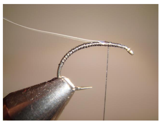
Tie in the tinsel