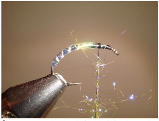
9 Insert a pinch of ice dubbing into the split thread