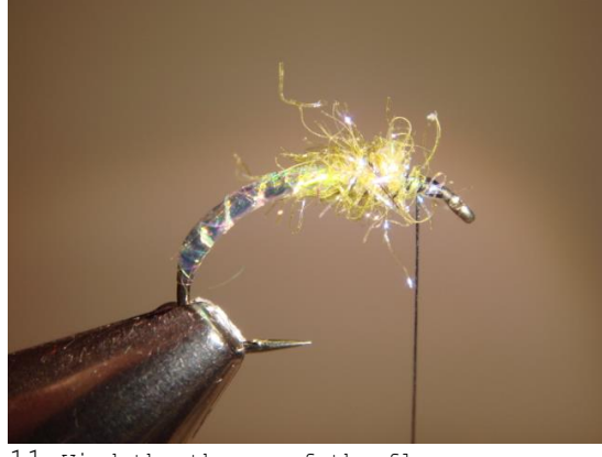
11 Wind the thorax of the fly