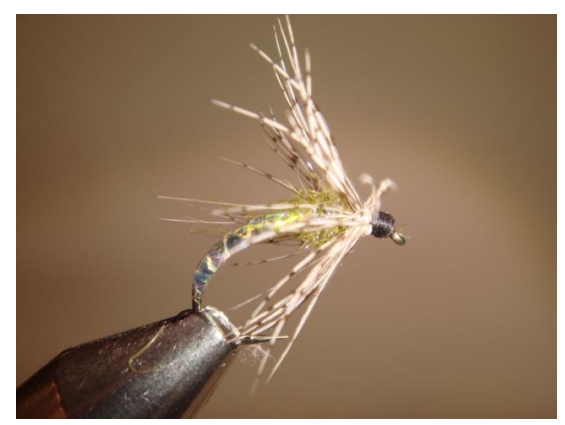
17 Wind the head of the fly 18 Whipfinish