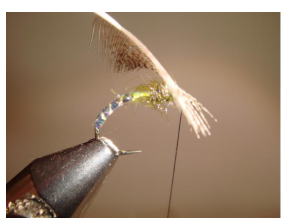
14 Tie in the feather by its tip at the eye of the hook