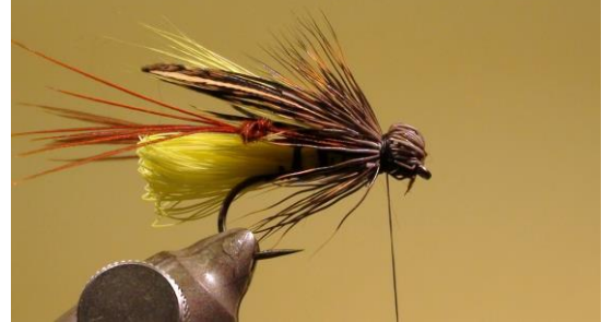
13 Flip back the deer hair tips 14 Tie off the deer hair tips in a way to create a thick head