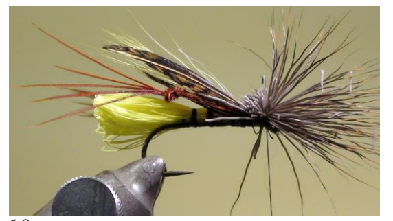
12 Tie in a bunch of deer hair directly behind the eye of the hook, the tips extending over the eye