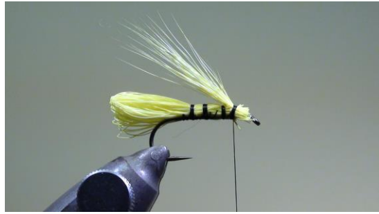
9 Tie in a small bunch of bucktail as a first wing