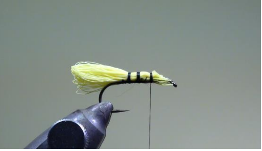
8 Create a segmented body with the tying thread