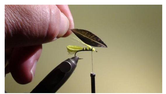
10 Prepare the partridge feather 11 Tie in the feather as a second wing which will be slightly shorter than the bucktail wing