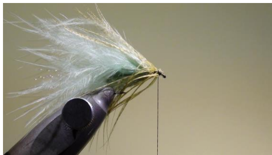
Wind the second hackle (forward) brushing back the fiber tips after \ each turn