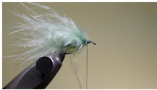
Wind the first hackle (forward) brushing back the fiber tips after each turn