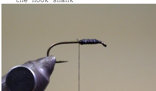
3 Tie in the thread at the eye of the hook