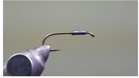
Secure the position of the wire with a drop of instant glue