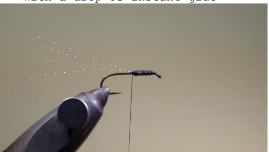
Tie in the Chrystalflash strands