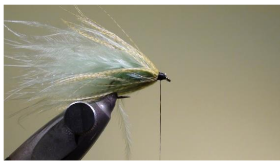
10 Wind the head