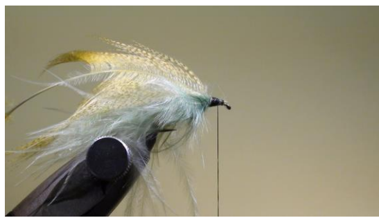
Tie in the teal feather with its tip