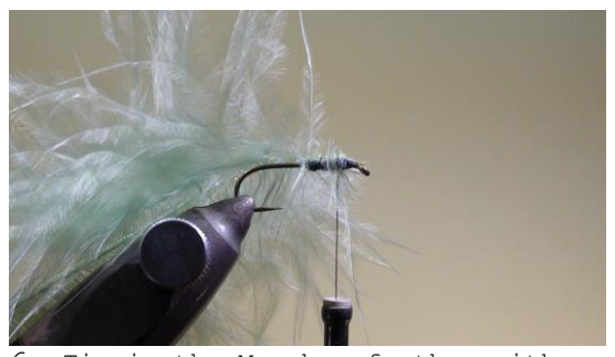
Tie in the Marabou feather with its tip