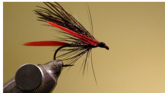
16 Secure your windings with a drop of black head cement.