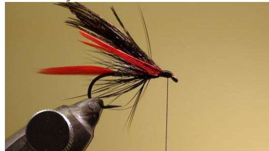
14 Wind the head.