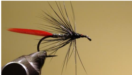
11 Wind a wet hackle for 3 turns.