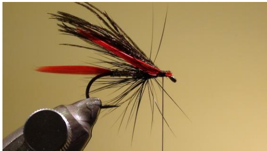
13 Tie in 4 condor substitute feather tips on each side of the shank.