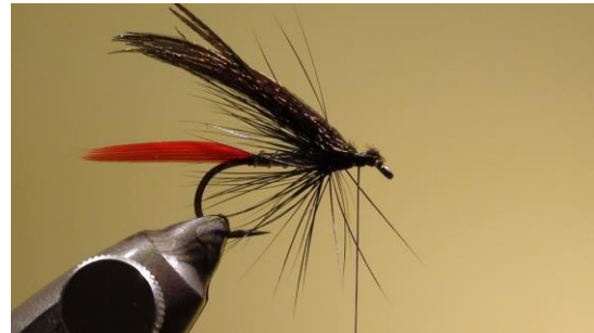
12 Tie in a bunch of peacock herls as a wing.