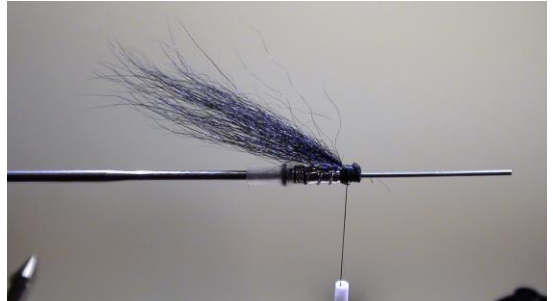
Tie in a bunch of artic fox hair (2 to 2.5 times the length of the tube) as a 14 wing