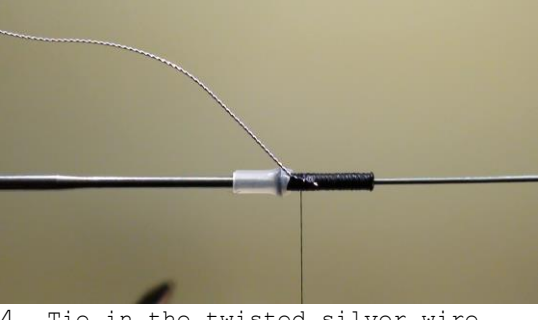
4 Tie in the twisted silver wire