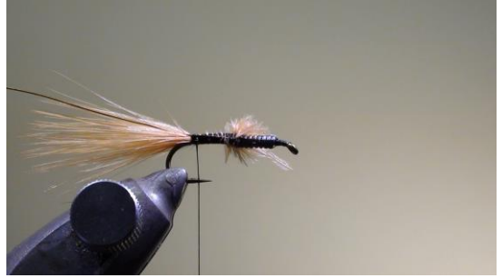
8 Tie in the ribbing wire