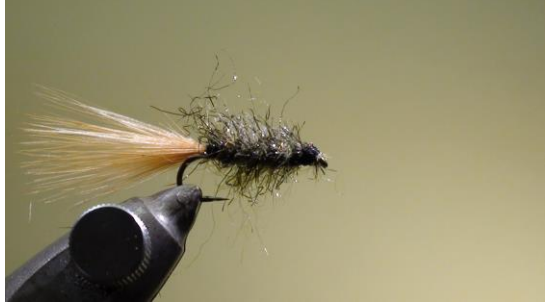
18 Brush out the dubbing