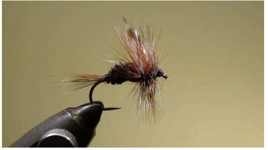
25 Apply a drop of transparent head cement to secure the windings