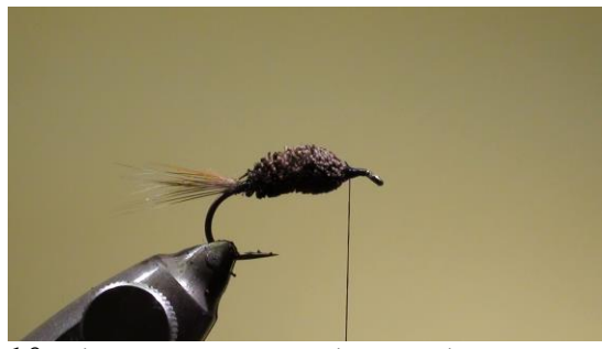
12 Singe the body using a lighter 13 Tie in the thread at the eye