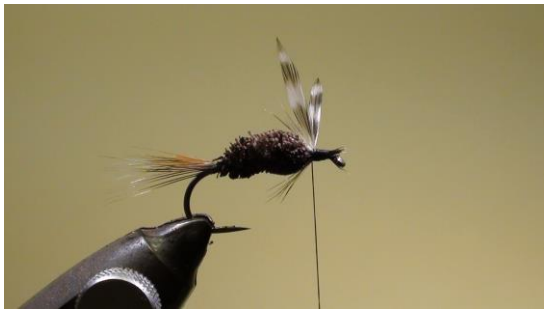
14 Tie in 2 grizzly cock feather tips as wings