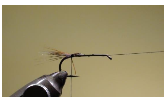
4 Make a dubbing loop at the curvature of the hook