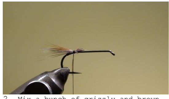
2 Mix a bunch of grizzly and brown cock feather tips