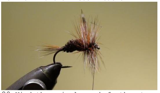
20 Wind the grizzly cock feather to the eye of the hook (3 turns behind an 3 turns in front of the wings)