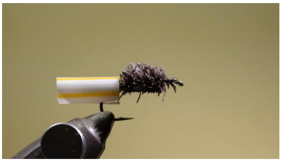
11 Slide the Drinking straw over the body as a protection for the tail