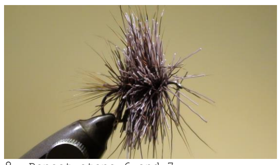
8 Repeat steps 6 and 7