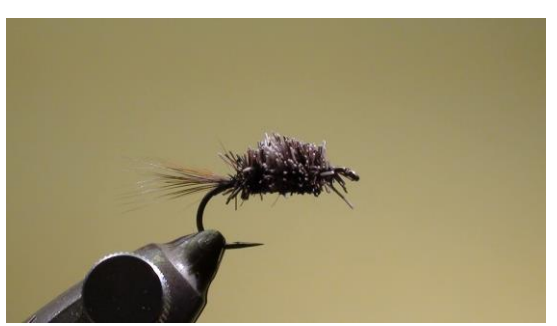
10 Shape the body roughly with your scissors