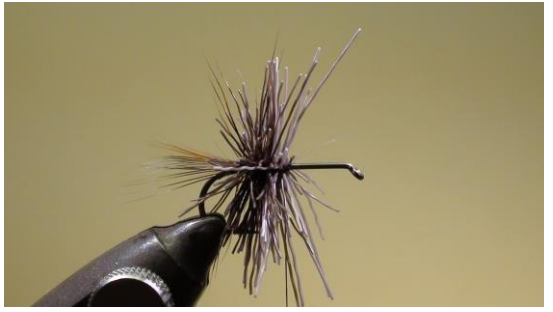
Twist a bunch of deerhair in the