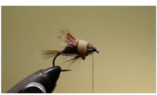
23 Wind the head of the fly 24 Whipfinish