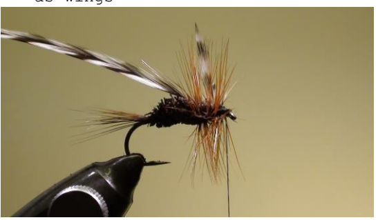
17 Wind the brown cock feather to the eye of the hook (3 turns behind an 3 turns in front of the wings)