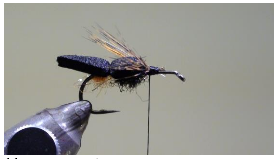
11 On each side of the hook shank, tie in a bunch of Pardo feather tips as wings