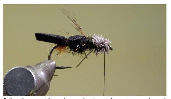
17 Shape the deer hair tips to a head