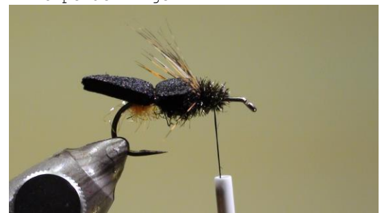
15 Wind the thorax with the reinforced peacock herl