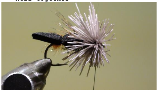
16 Tie in a bunch of deer hair in front of the thorax