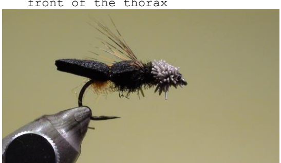
18 Whipfinish behind the eye of the hook