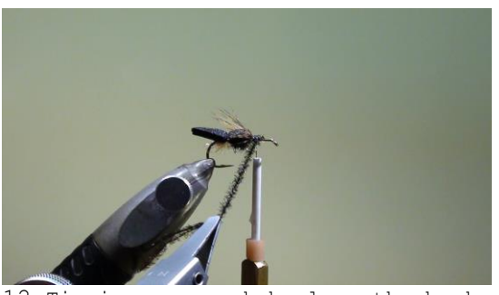
12 Tie in a peacock herl on the hook shank