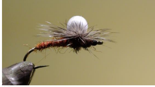
17 Whipfinish around the Styrofoam ball just above the hook shank