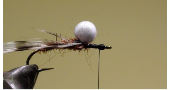
11 Wind the thread to the eye of the hook