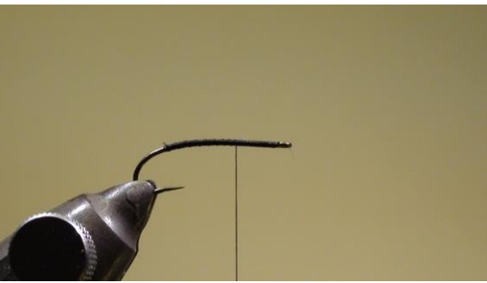
3 Wind the thread back to the place where we will tie in the Parachute post