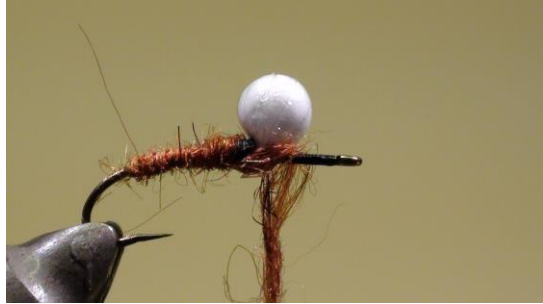
9 Wind the rear part of the body with the dubbed thread