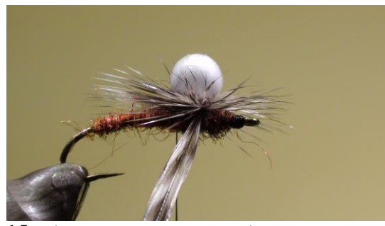
15 Wind the Parachute with the grizzly feather (each successive turn under the previous turn)