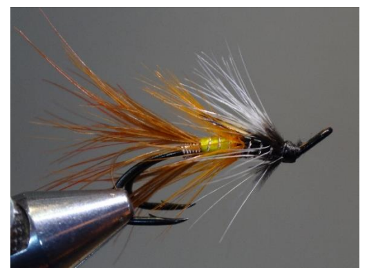
30 Wind the head of the fly 31 Whipfinish