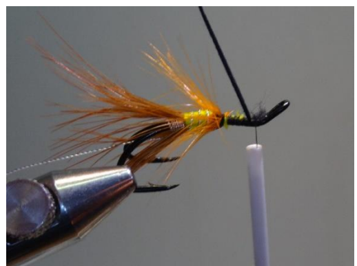
Wind the tying thread to the eye of the hook