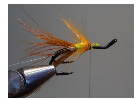
18 Flip back the ribbing wire