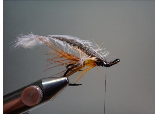
Tie in the silver badger cock feather with its tip

Wind the ribbing of the front part of the body with the silver wire Tie off the ribbing wire