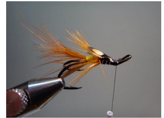
26 Tie in 2 jungle cock feathers as a wing (roofed)