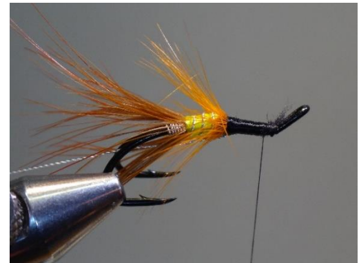
Wind the UNISTRETCH to the beginning of the center hackle and then back to the eye of the hook