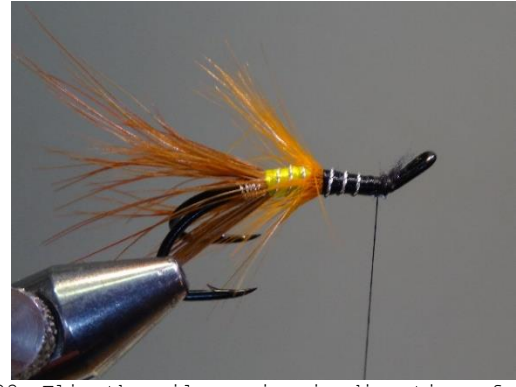
23 Flip the silver wire in direction of the eye of the hook

Wind the ribbing of the front part of the body with the silver wire Tie off the ribbing wire