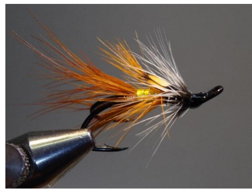
Apply a drop of black head cement (or UV glue) on the head