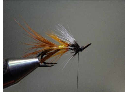
Wind 2 turns of wet hackle 28 29 Tie off the silver badger cock feather