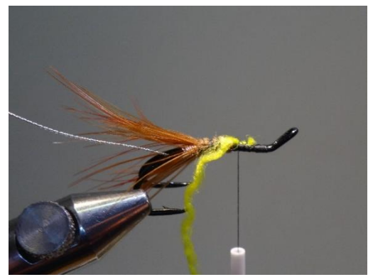
11 Tie in the yellow UNISTRETCH