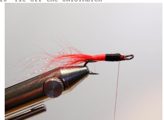
12 Wind the UNISTRETCH to the center of the hook shank and then back to the front of the hook shank