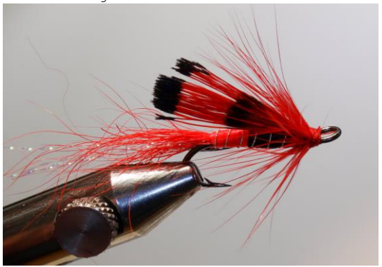
20 Wind the head of the fly 21 Whipfinish