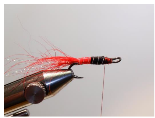
14 Wind the ribbing wire to the eye of the hook