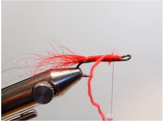
8 Tie in the red UNISTRETCH