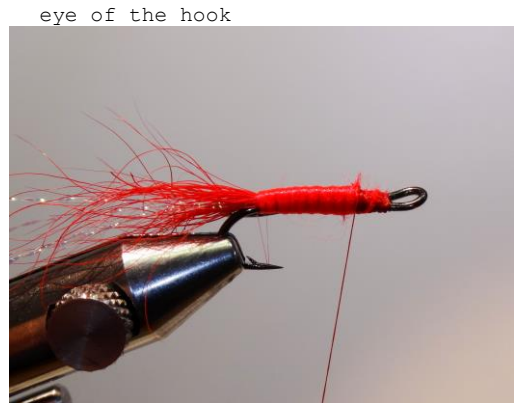
Wind the UNISTRETCH to the beginning of the tail and then back to the front of the hook shank