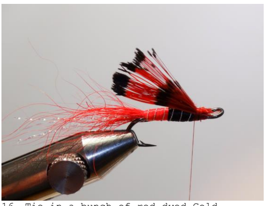
16 Tie in a bunch of red dyed Gold Pheasant tippets as a wing