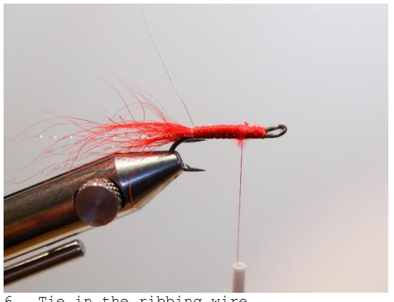
Tie in the ribbing wire Wind the thread in direction of the