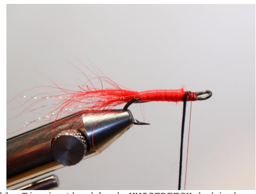
11 Tie in the black UNISTRETCH behind the eye of the hook