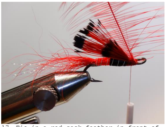
17 Tie in a red cock feather in front of the wing