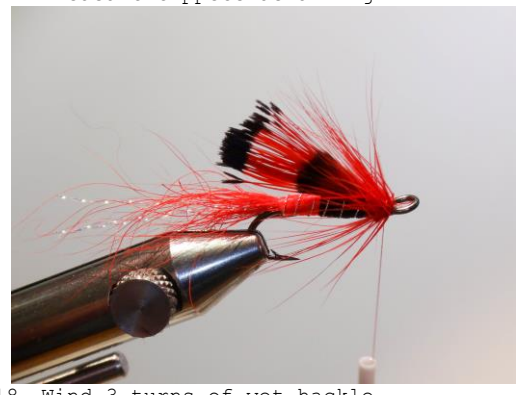
18 Wind 3 turns of wet hackle 19 Tie off the cock feather