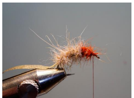
12 Twist the hare dubbing in the loop