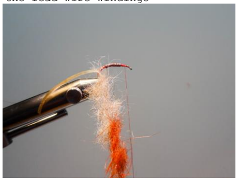
Insert a bunch of grey hare dubbing followed by a smaller bunch of red hare dubbing into the dubbing loop