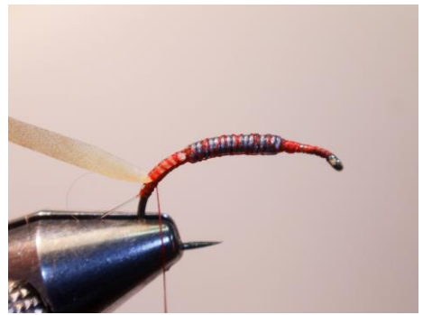
Tie in the strip of eel skin behind the lead wire windings