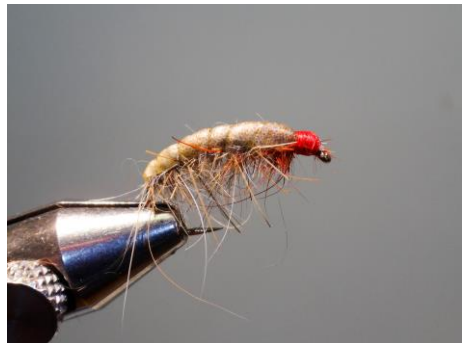
18 Wind the head of the fly