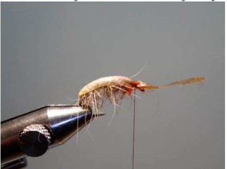
15 Flip the eel skin to the eye of the hook