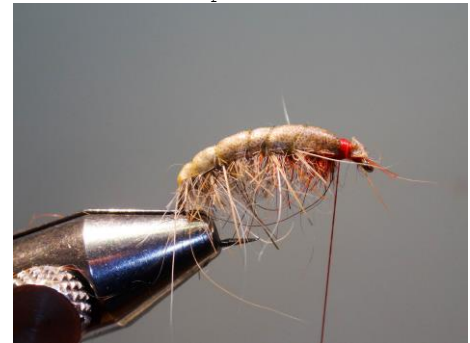
Wind the ribbing nylon to the eye of the hook