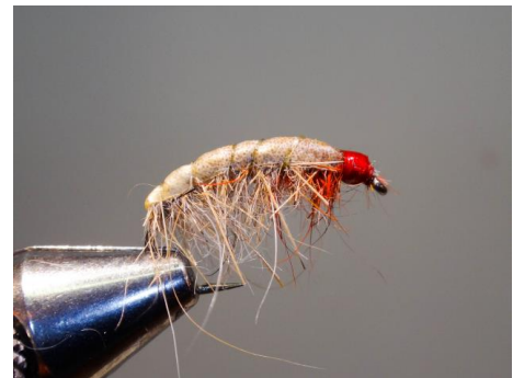
20 Brush out the dubbing 21 Apply a drop of clear head cement