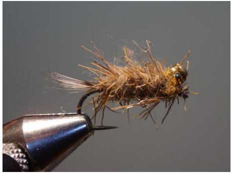
21 Trim off excessively long hair tips