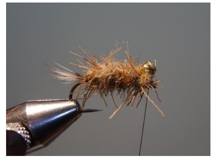
17 Wind the body with the Mouflon dubbing