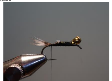
12 Tie in the jungle cock feather tips as a short tail just behind the copper nail