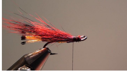
Tie in the red dyed squirrel tail as a 15 wing which should slightly extend over the tail of the fly