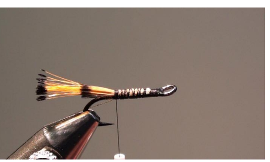
6 Tie in a Gold pheasant tippets