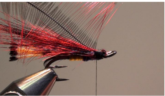
Tie in the scarlet badger cock feather 16 by its tip