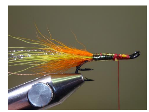
12. Wind the rear part of the body with the gold tinsel