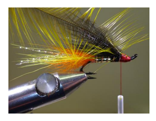
21. Tie in the yellow badger cock feather