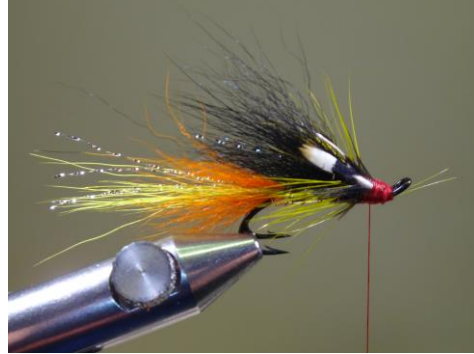
23. Tie in the jungle cock cheeks