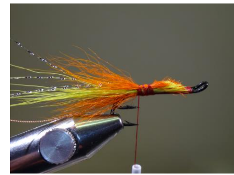
8. Cut off the excess9. Tie in the ribbing wire10. Wind the thread to the center of the hook shank