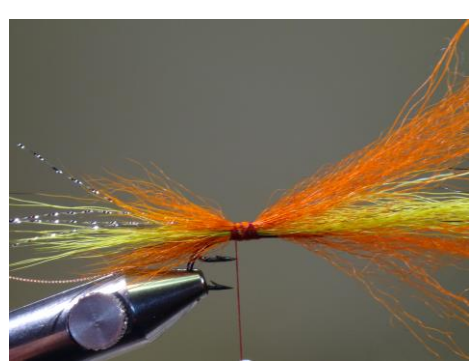
Tie in a bunch of fox hair (length of hook shank)