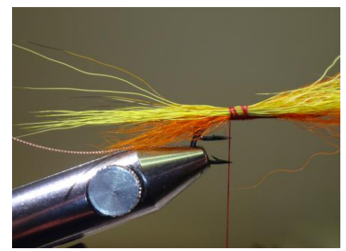
5. Tie in a bunch of yellow bucktail hair (double hook shank length)