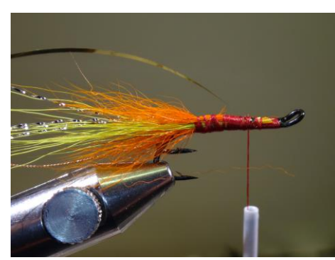
11. Tie in the gold tinsel