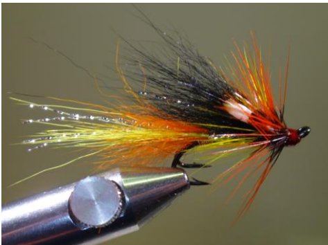
28. Apply a drop of UV glue to the head