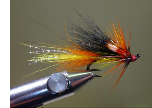
26.Wind the head 27.Whipfinish

24. Tie in the orange badger cock feather