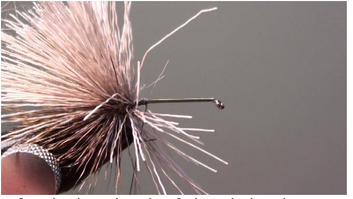
Tie in a bunch of deer hair tips at the tie in point.

1. Tie in the thread at the beginning of the curvature of the hook.