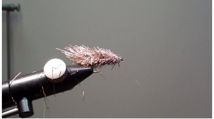
9. Shape the body with your scissors