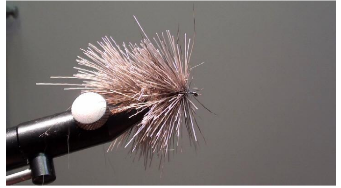
8. Whipfinish and cut off the thread

Form a dubbing loop and insert another bunch of deer hair into the loop Twist the loop