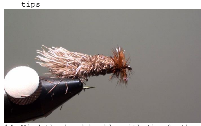
14. Wind the head hackle with the feather 15. Whipfinish