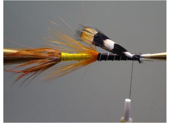
26 Tie in 2 jungle cock feathers as a wing (roofed)