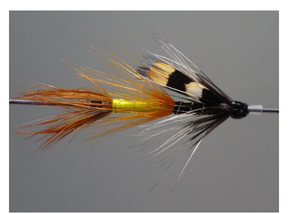
33 Apply a drop of UV glue or black head cement on the head to secure your windings