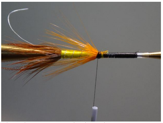
18 Flip back the ribbing wire