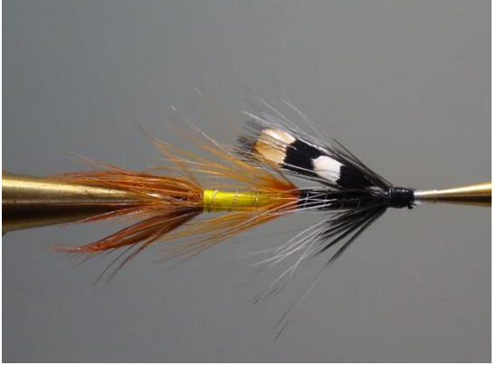
30 Wind the head of the fly 31 Whipfinish 32 Cut off the thread