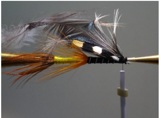
27 Tie in the silver badger cock feather with its tip