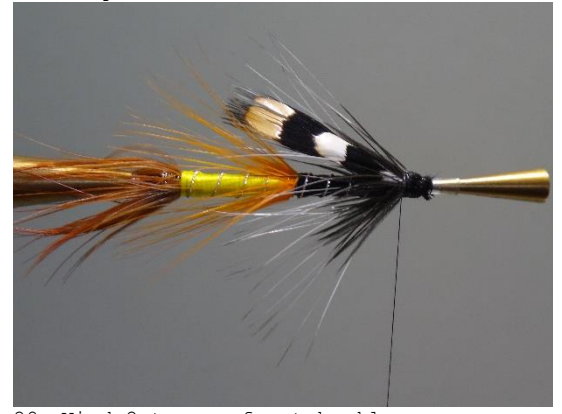
28 Wind 2 turns of wet hackle 29 Tie off the silver badger cock feather