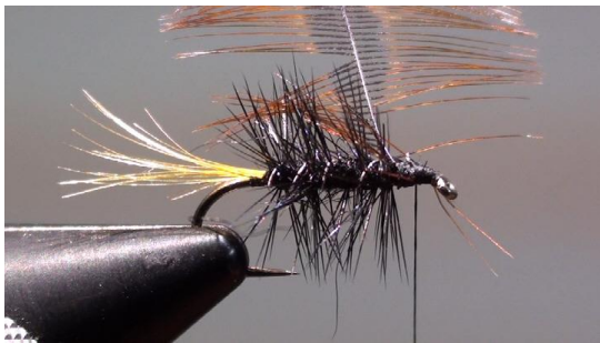
12. Tie in a ginger badger cock feather by its tip