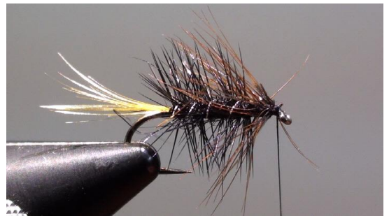
13. Wind the head hackle