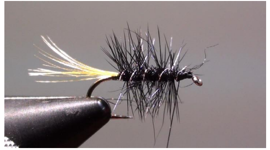
10. Wind the ribbing wire to the eye of the hook