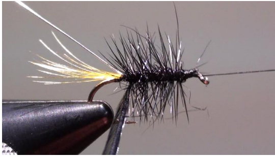
9. Palmer the body to the beginning of the tail