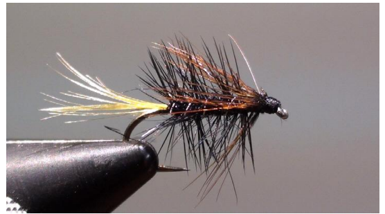
16. Apply a drop of transparent head cement to the head