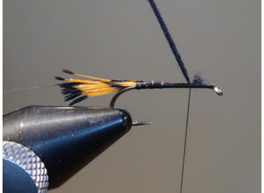
3. Tie the silver tinsel or wire. 4. Wind the thread to the eye of the hook 5. Tie in the black floss