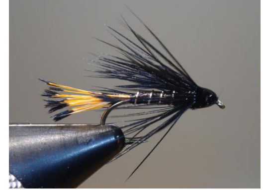
15. Apply a drop of transparent head cement onto the head