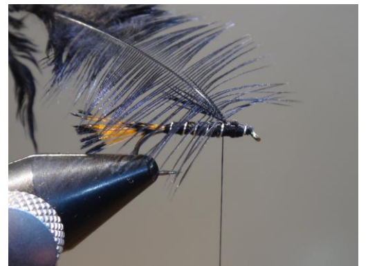
10. Tie in the black hen feather by its tip

Wind the wet hackle (2-3 turns) Wind the head of the fly Whip finish Cut off tying thread