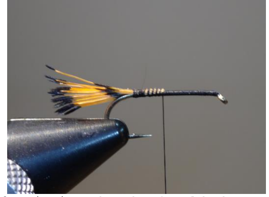
Tie in a bunch of gold pheasant tippets as a tail.