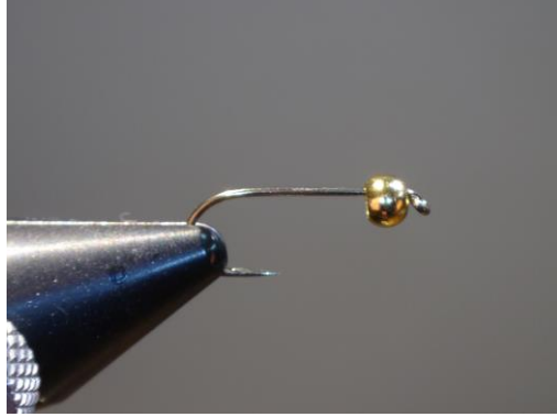
1. Insert the beadhead