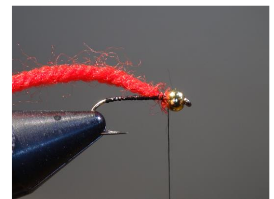
3. Tie in a strand of red wool directly behind the bead