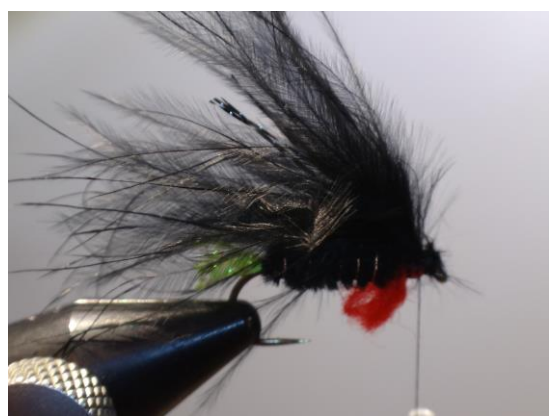
16 Tie in a second bunch of Marabou feather tips on top of the first one