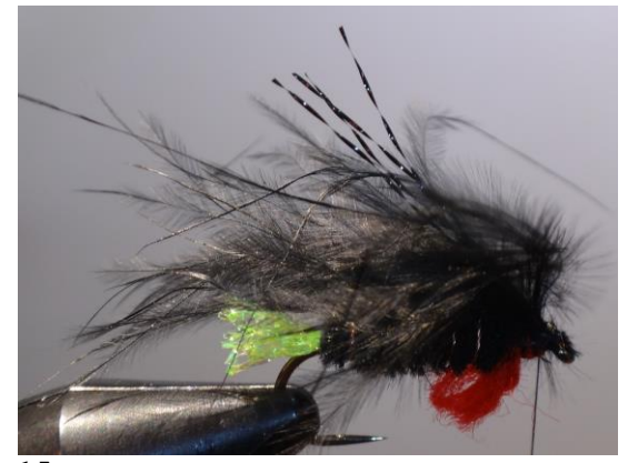
15 Tie in 4 strands of black Chrystalflash on top the wing