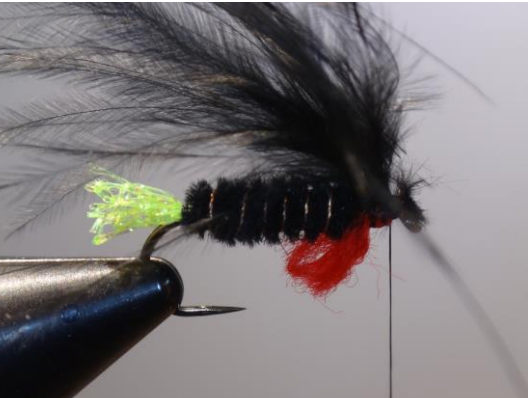
14 Tie in a first bunch of Marabou feather tips as a wing