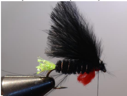
17 Trim the wing using your scissors