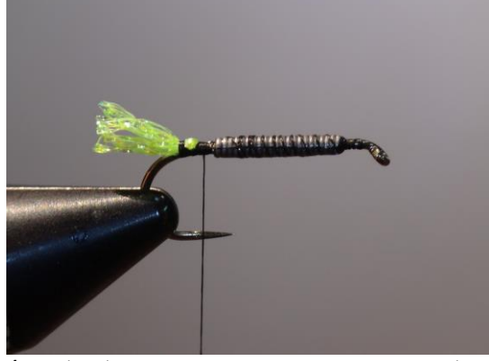
Tie in 2 strands of sparkle braid 5 Tie in the twisted copper wire 4 as a short tail