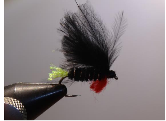
18 Wind the head of the fly 19 Whipfinish