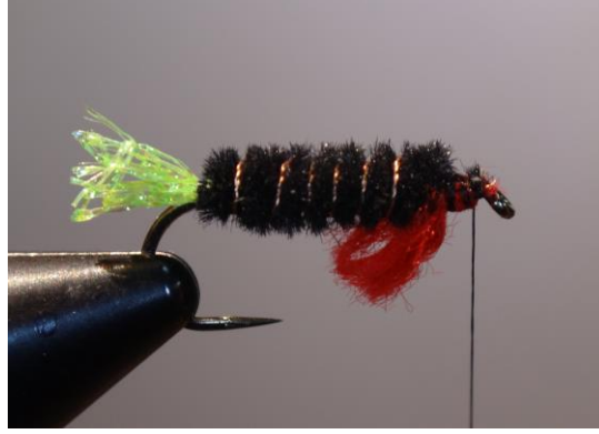
13 Tie in the red wool strand as a throat