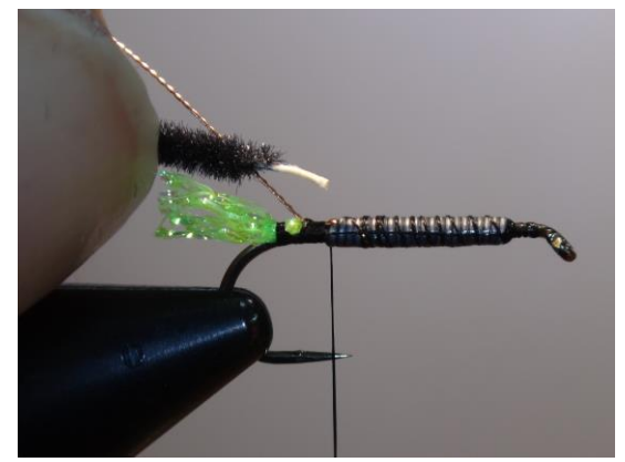
6 Remove the fluff from the tip of the core of the chenille